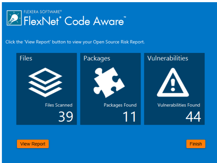
Figure 1: Perform fast, automated scans of your products.

You've heard the story many times before. Software had to be pulled from the market right before shipping because of a previously undiscovered software security vulnerability. Remember Heartbleed and Apache Struts2? Like all developers, you're most likely aware that hidden risks are on the rise, but that doesn't mean you're aware of where they're hidden, where you might be vulnerable, or what you're exposing users to.